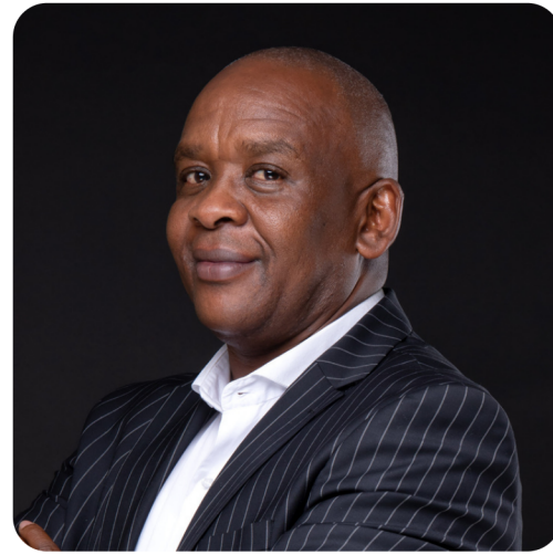
Harris Team Leader