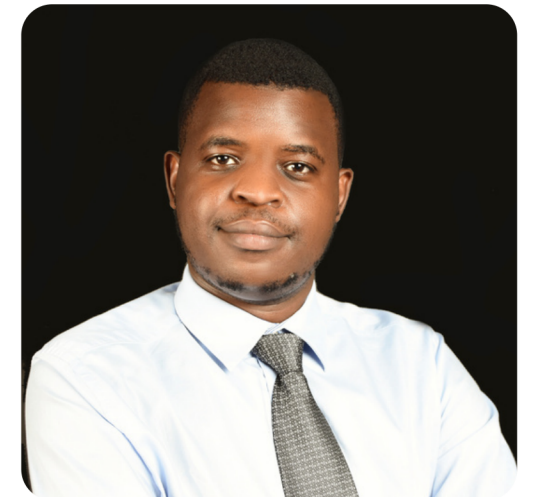
Brian Underwriting & Claims